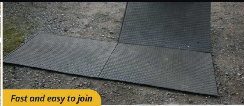
Fast and easy to join