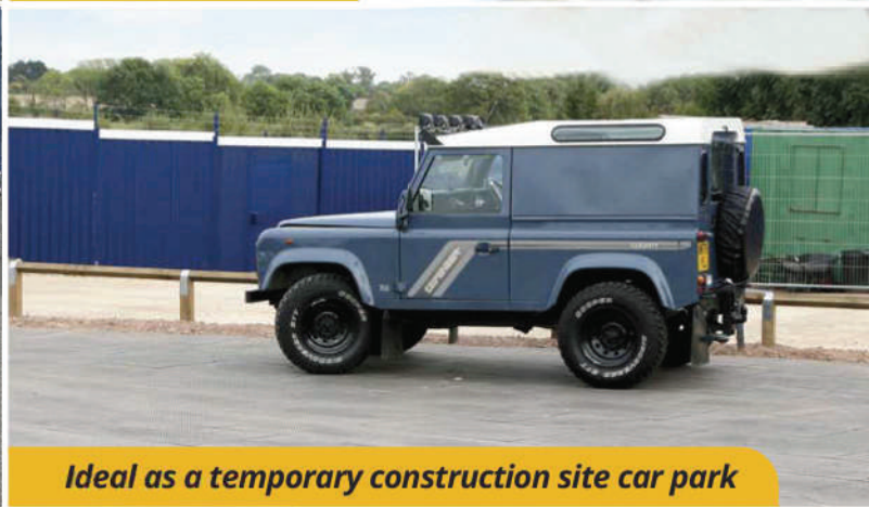
Ideal as a temporary construction site car park