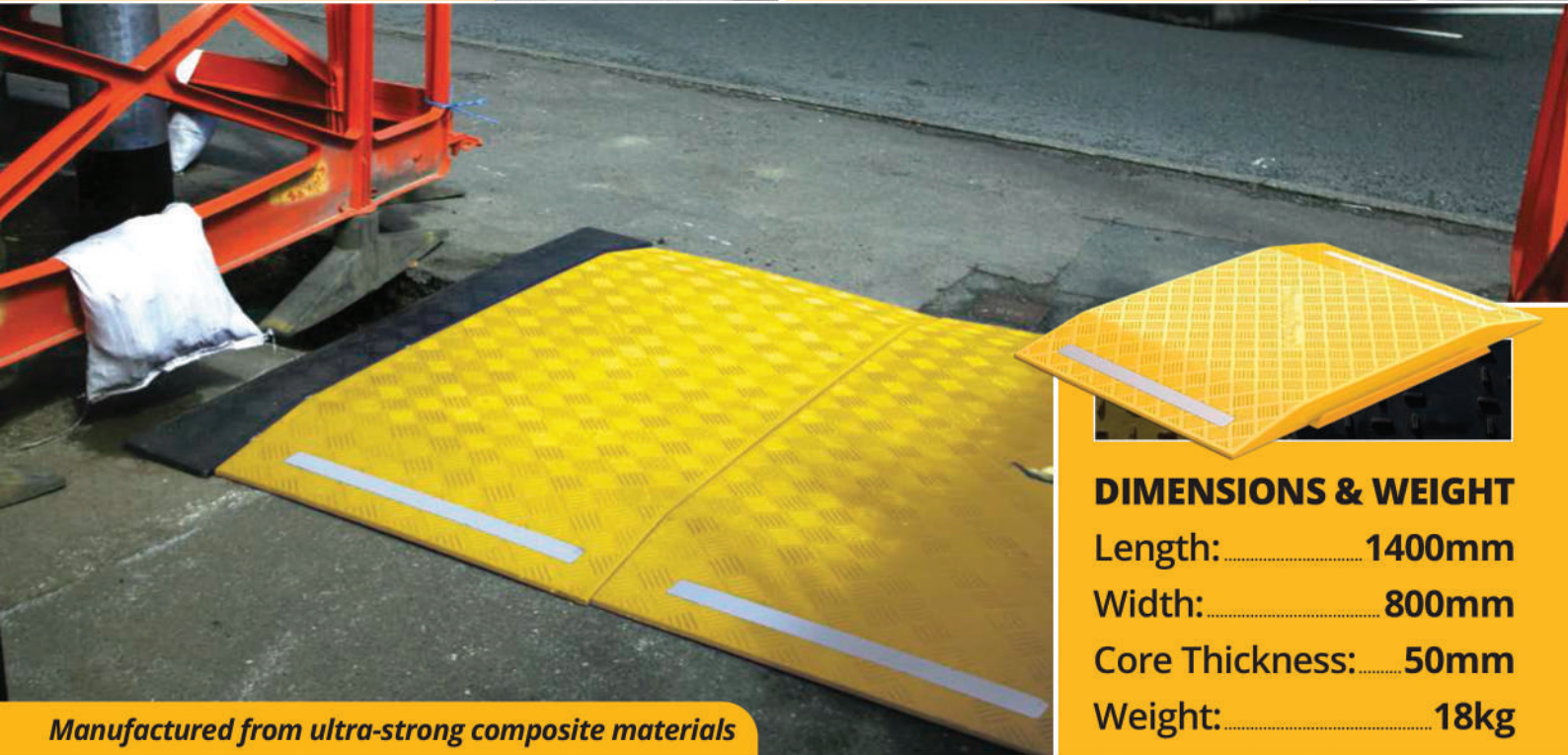
Manufactured from ultra-strong composite materials