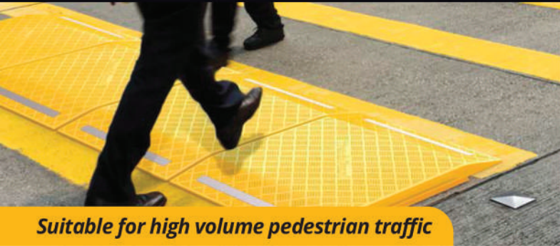
Suitable for high volume pedestrian traffic