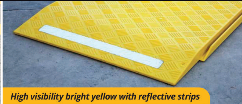
High visibility bright yellow with reflective strips