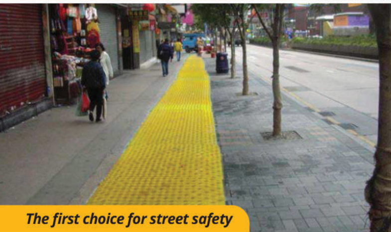
The first choice for street safety