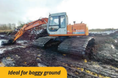
Ideal for boggy ground