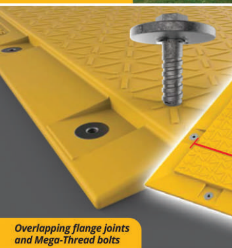
Overlapping flange joints and Mega-Thread bolts

Material: HDPE plastic, fully recyclable