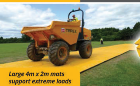
Large 4m x 2m mats support extreme loads