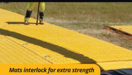
Mats interlock for extra strength