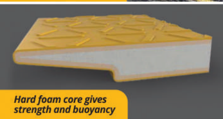
Hard foam core gives strength and buoyancy